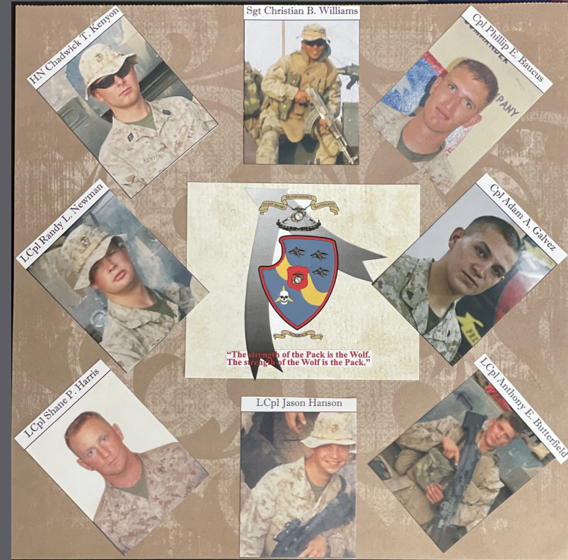
Memorial Photos of Fallen 3 rd LAR Marines from the 2006 Deployment