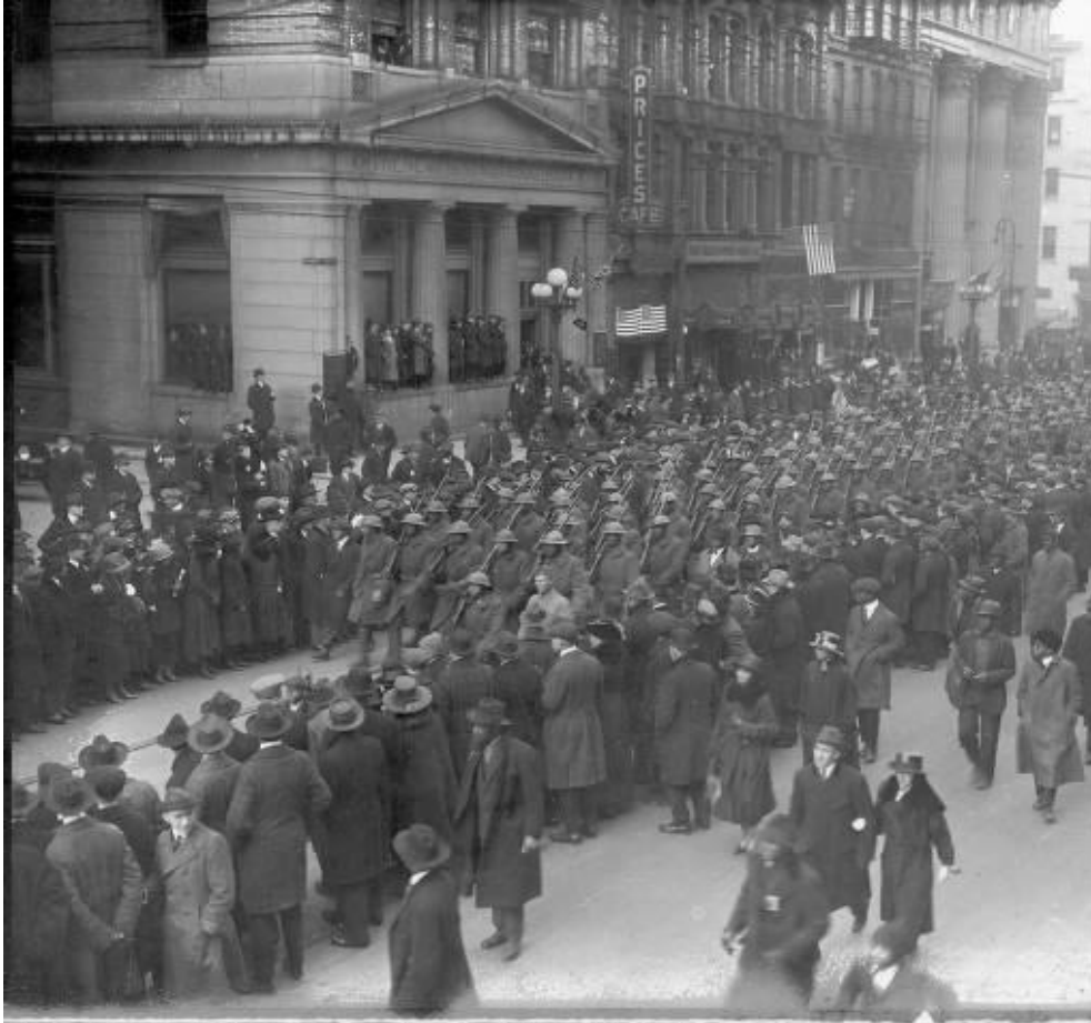
“Jack Doberson.” Image of the 372 nd .