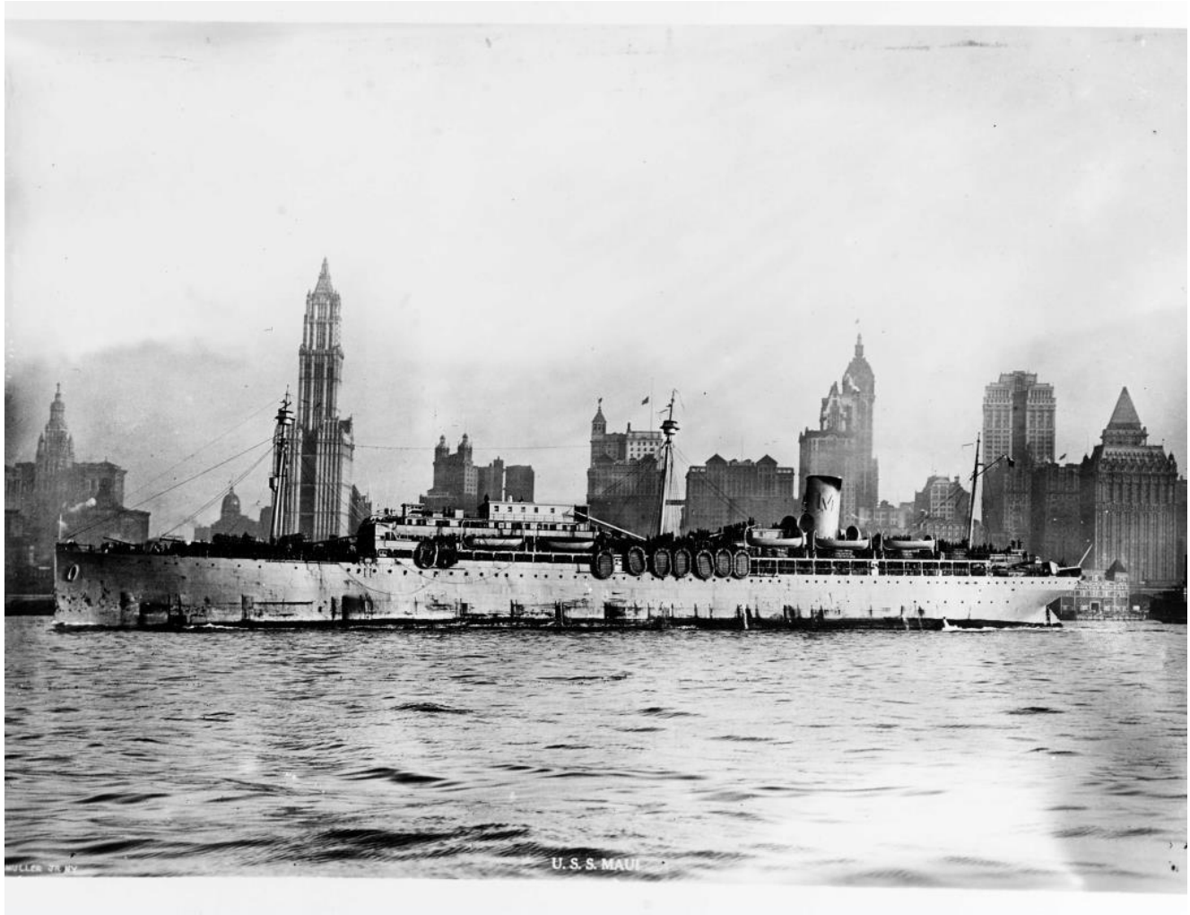
“Edgar Robinson.” Photograph of U.S.S Maui .