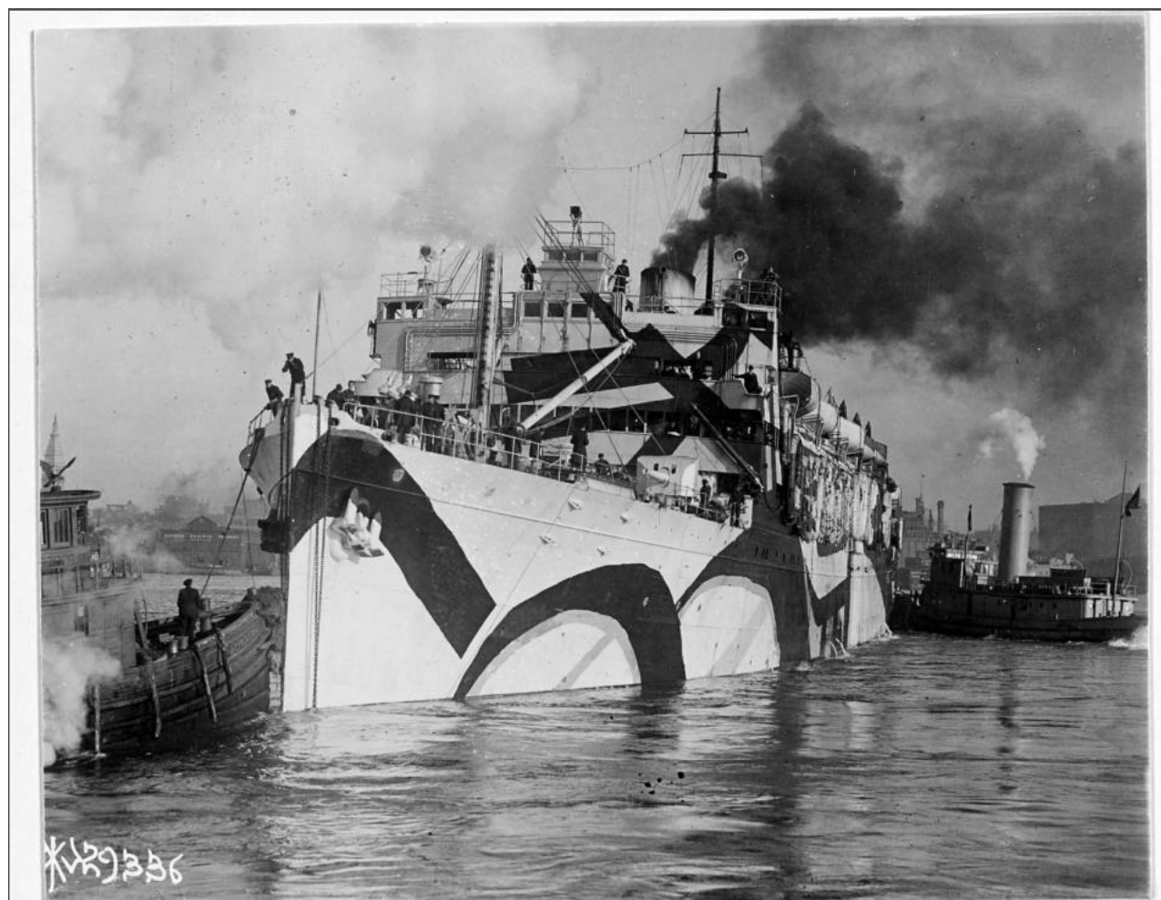
“Edgar Robinson.” Photograph of U.S.S. Orizaba .